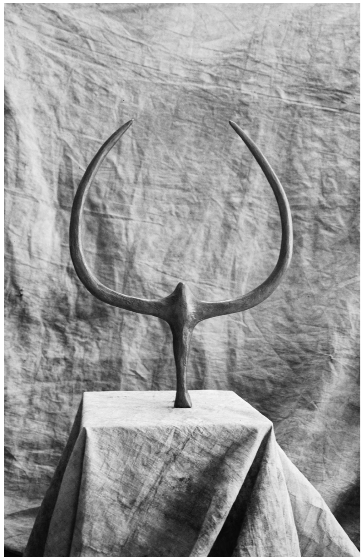
“DAAL” (DEER) BRONZE, BLACK PATINA, GOLD LEAF H. 152 X 152 X 36 CM