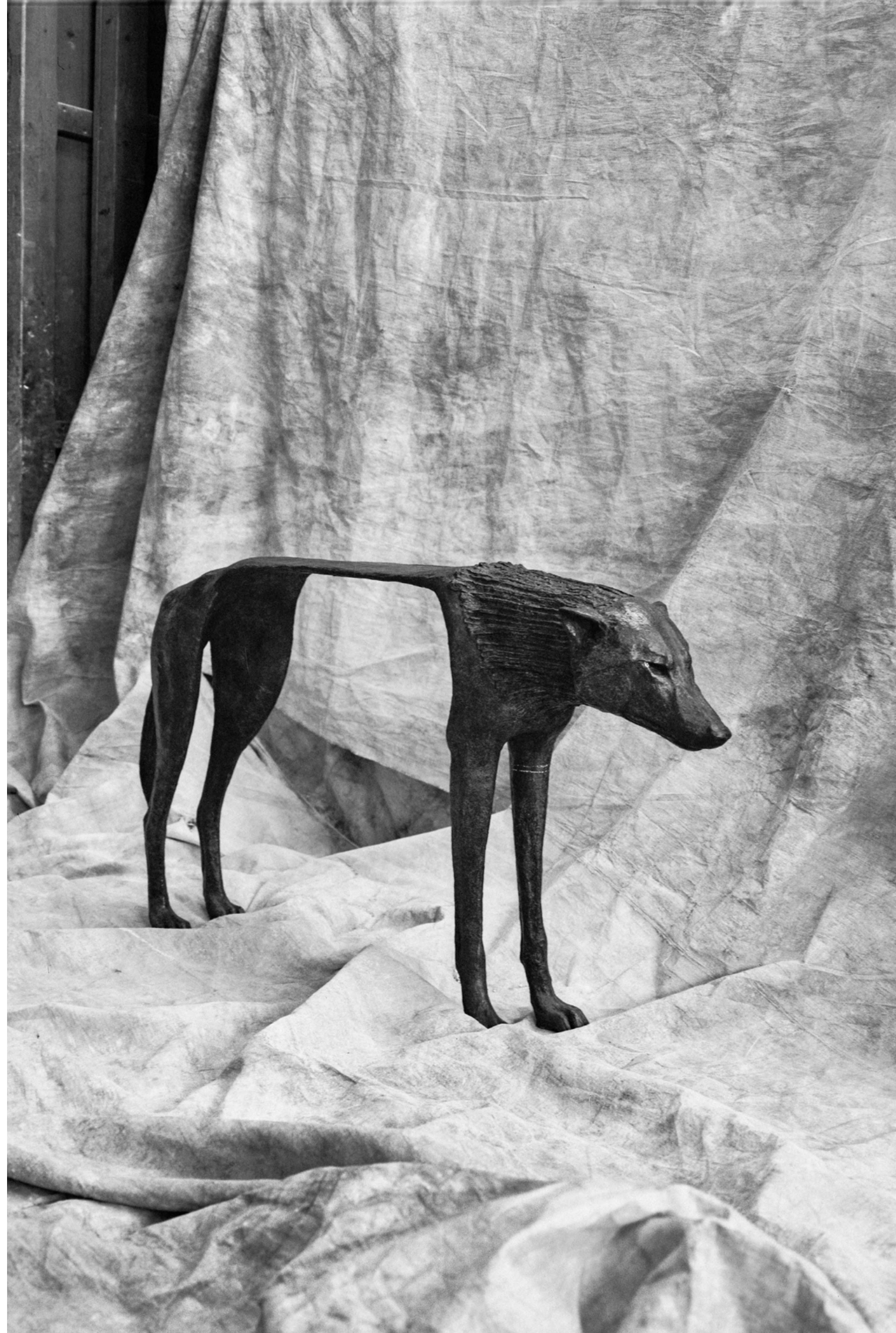
“WEPWAWET” (WOLF) BRONZE, BLACK PATINA, GOLD LEAF H. 74 X 150 X 28 CM