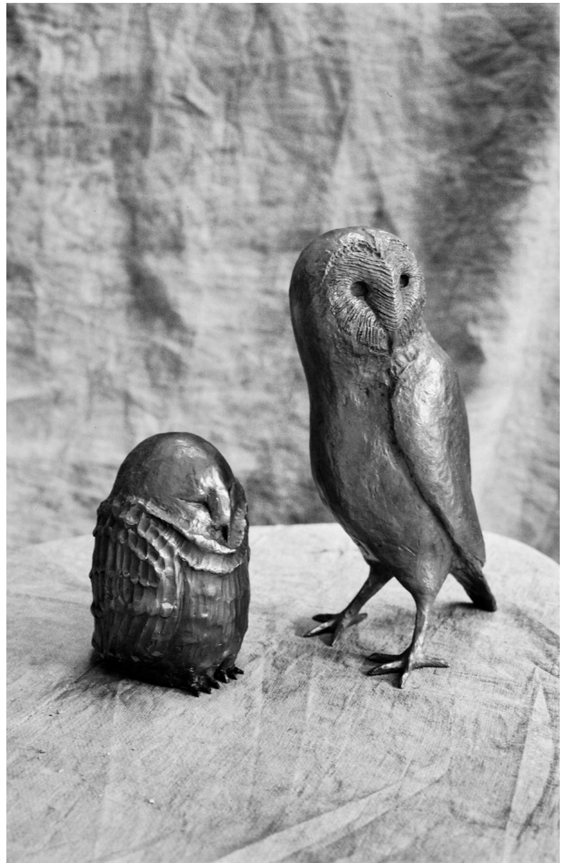
“ATHENE NOCTUA” (SMALL OWL) BRONZE H. 20 X 16 X 15 CM