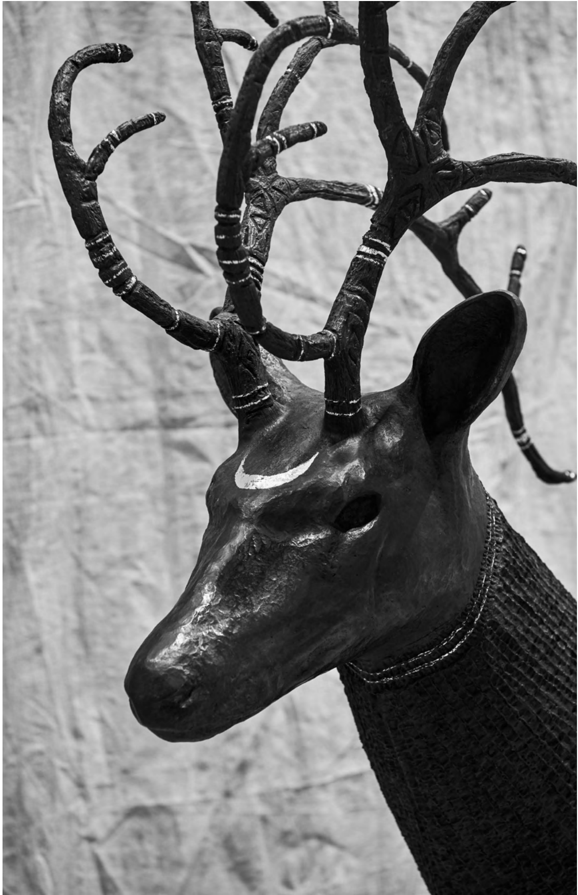
“AME-NO-KAKU” (STAG) BRONZE, BLACK PATINA, GOLD LEAF H. 206 X 193 X 43 CM